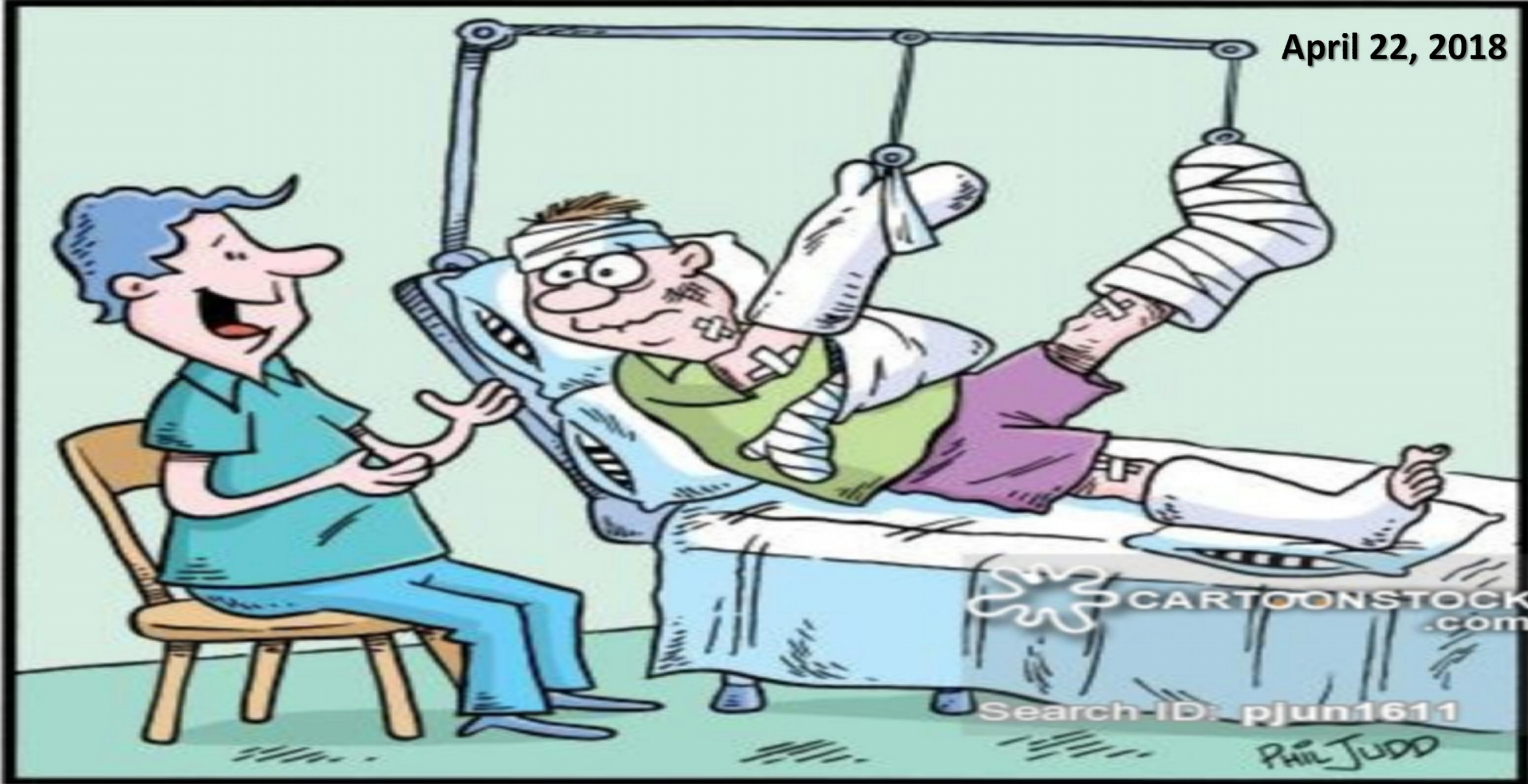
“I see marriage is agreeing with you.”